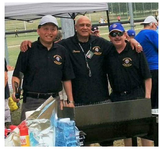
July 14 was a beautiful day to barbeque for this baseball tournament held by the Special Olympics.