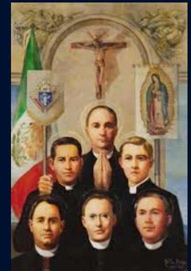
The Mexican Martyrs