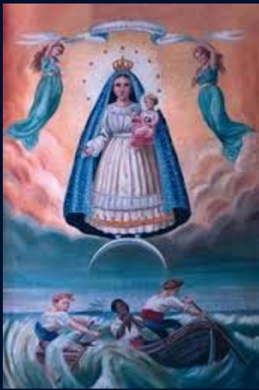
Our Lady of Charity