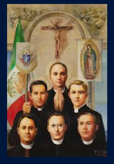
The Mexican Martyrs

Total State Membership as of July 30, 2015: 7500(+16)