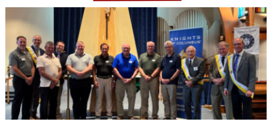
Last year's Double Star Council 3562 District 63 is already at 7 new members in July & 70% of Quota !