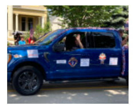
4<sup>th</sup> of July Parade - Racine, WI Members of Racine Council 697 featuring Racine Knights of Columbus