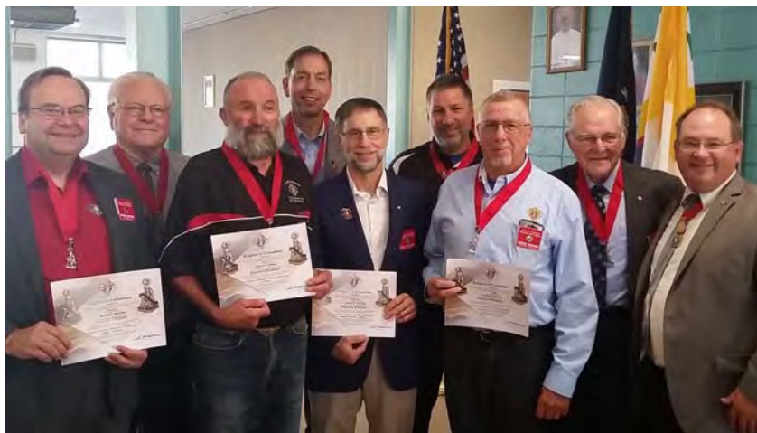
Superior District Deputies