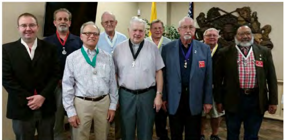
The Officers of Council 722 welcome Brother Knights and their families to a new Council year!