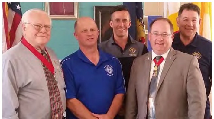
2016—2017 Star Councils Superior